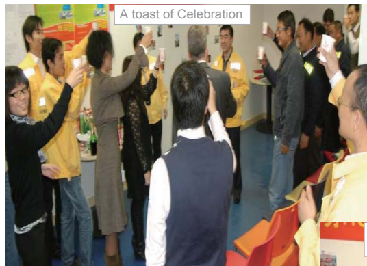
A toast of Celebration